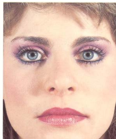
Bulbous nose and tip were reshaped, resulting in an overall refinement