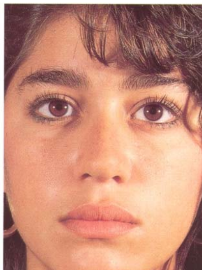
Bulbous nose overshadowed her total appearance