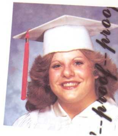
My high-school graduation pic...proof of what I looked like!

Half my size with a brand-new nose, thanks to diet and doctor.